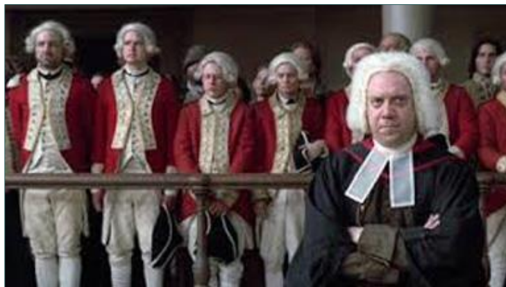
Actor Paul Giamatti as John Adams, in the HBO miniseries about the Founding Father

Had the trial been in the court of public opinion, the soldiers may have all been found immediately guilty of murder; however, with John Adams defending the soldiers, only two of them were found guilty of manslaughter, not murder. Adams said about the trial, "The part I took in defense of . . . the soldiers, procured me anxiety, and obloquy enough. It was; however, one of the most gallant, generous, manly and disinterested actions of my whole Life, and one of the best pieces of service I ever rendered my country. Judgment of death against those soldiers would have been as foul a stain upon this country as the executions of the Quakers or witches, anciently. As the evidence was, the verdict of the jury was exactly right." ( Adams )