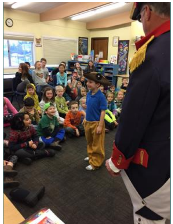
One of Compatriot Will's audience gets to try on colonial dress

Washington SAR Compatriots present items from several travelling history treasure chests that have been assembled for the specific purpose of sharing what life was like for people living during the American colonial period and America’s war for independence from Great Britain. In