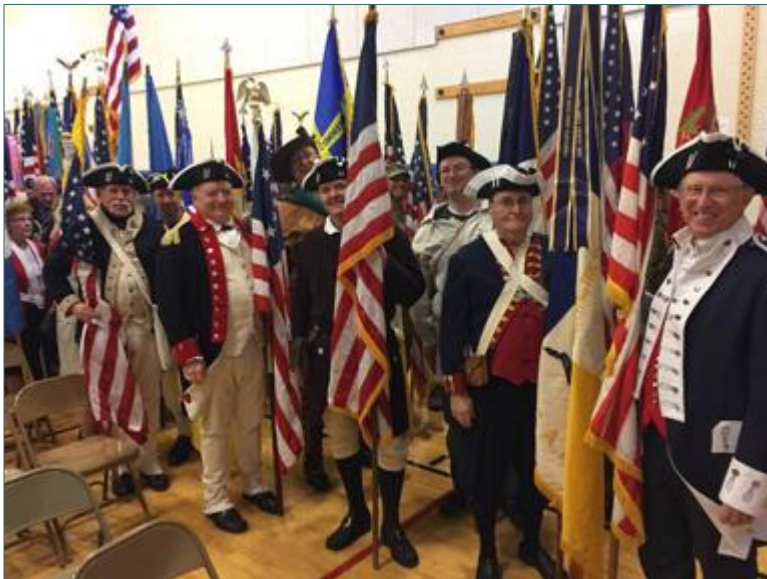
WASHINGTON SAR Color Guard was well-represented at Tacoma's Massing of the Colors Event

And whereas hundreds of military units, veterans, civic organizations, and both the Sons & Daughters of the American Revolution participate in Massing of the Colors; and Whereas the SAR Washington State Society Color Guard participates in full uniform annually at Massing of the Colors, with several SAR & DAR Chapters; and Whereas the Washington State SAR-DAR Fife & Drum Corps participate in full uniform to lead the posting of colors at Massing of the Colors;