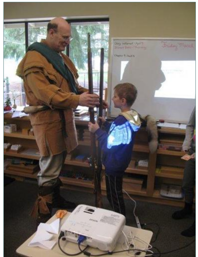
A student at Bellevue Montessori Academy compares the weight of a Brown Bess musket to a Kentucky long rifle

In 2016, the Washington SAR Color Guard made 90 presentations across the state, reaching over 2,000 children and adults with the stories of the founding fathers.