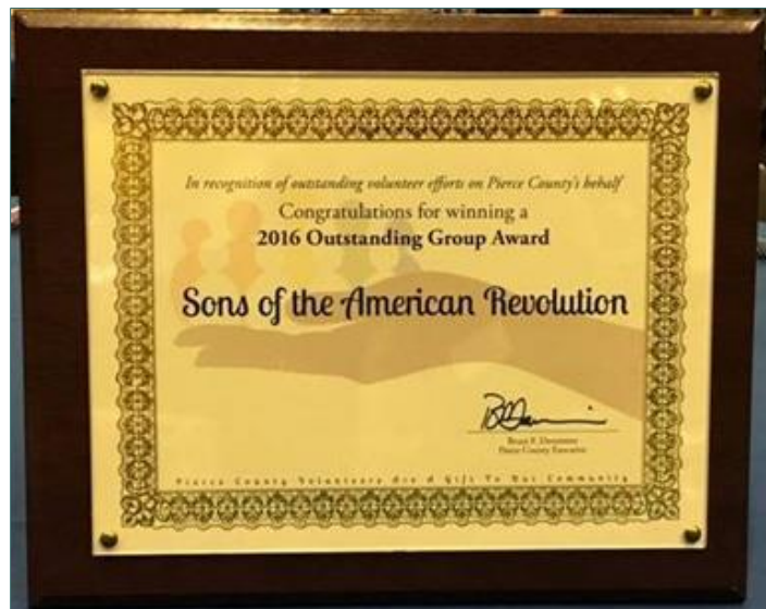
Washington SAR's Outstanding Volunteer Organization Award

Compatriots from three chapters have participated in the Pierce County New Citizenship Ceremony since it began: Alexander Hamilton, Cascade Centennial and John Paul Jones. A HUGE “well done” to all!